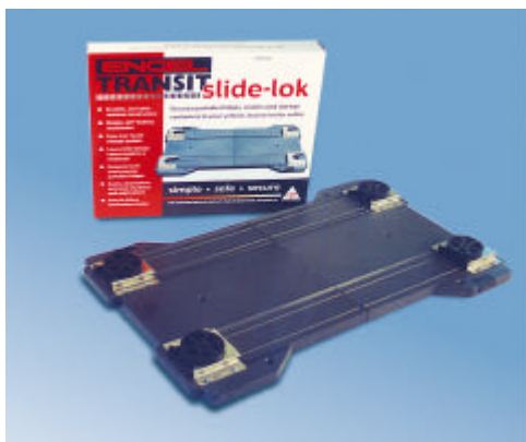
Slide-lok - TSL515 & TSL015DADAPTOR